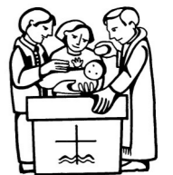
I baptize you in the name of the Father and of the Son and of the Holy Spirit

Baptisms in Templeraíne are held on the 1st Sunday of each month and in Avoca on the 3rd Sunday. Bookings for these can be made in the respective Parish Offices. (Templeraíne (0402) 31943 or Avoca (0402) 35156)